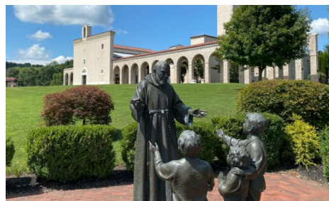
Exhibit. The Sacred Relics Exhibit is only at the Shrine a few times a year. A pre-ordered boxed lunch will